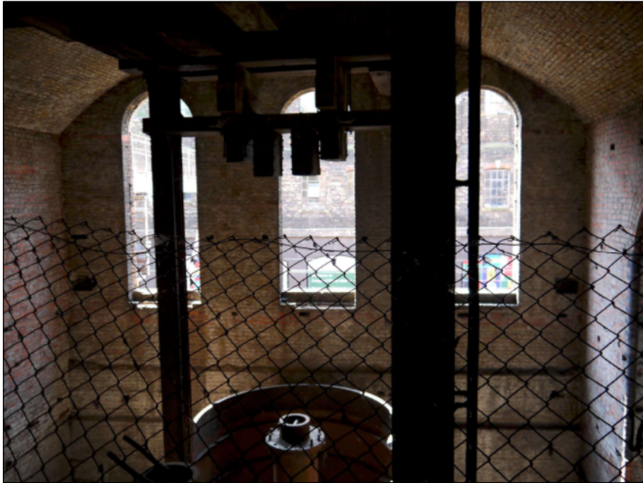
DOUBLE HEIGHT HYDRAULIC ACCUMULATOR PLANT ROOM