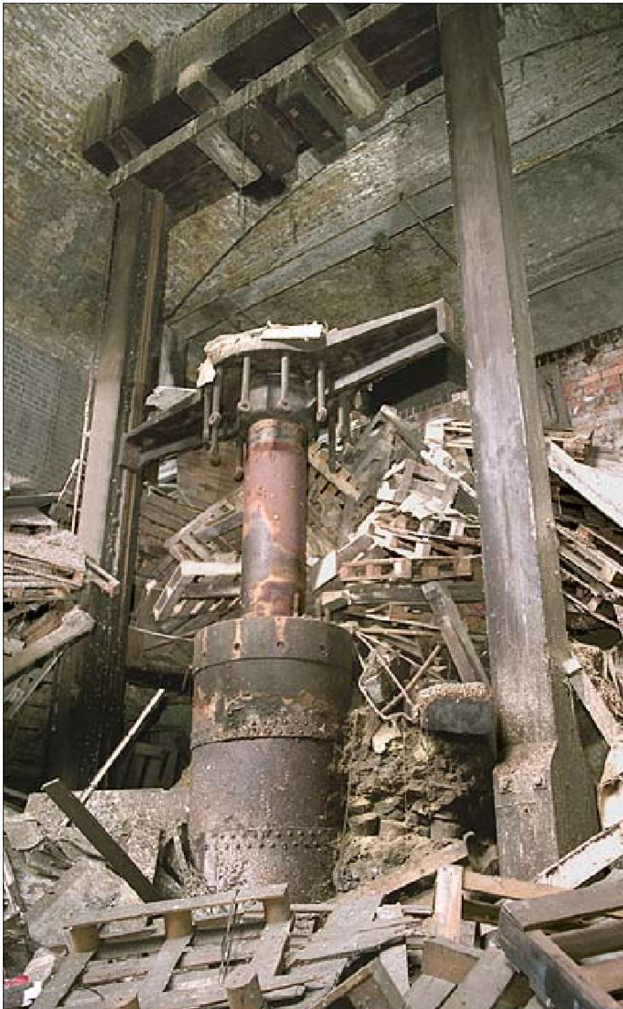
EXISTING HYDRAULIC ACCUMULATOR PLANT EQUIPMENT TO BE RETAINED INSITU

NOTE: REFER TO PLOWMAN CRAVEN SURVEY DRAWINGS: 15532-010T-01 (A) - 3D Street Survey 15532-010T-02 (B) - 3D Site Topo 15532-010T-03 (A) - Boundary Drawing 15532-010W-02 (A) - Railway Cutting 15532-013E-03 - North Elevation of Listed Arches 15532-013E-08 - South Elevation of London Road 15532-013E-10 (A) - Accumulator Plant Survey 15532-013T-01 (B) - Planimetric Survey W15532-010SM - 3D Arch Survey